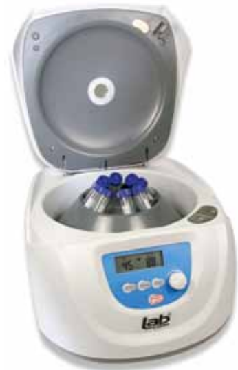
400.003.300 Clinical Loaded with 8 x 15mL Centrifuge Tubes (tubes not supplied)