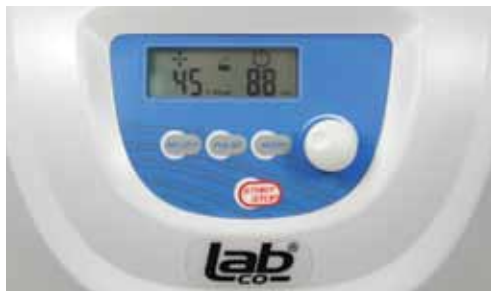
400.003.300 Control/Display Panel