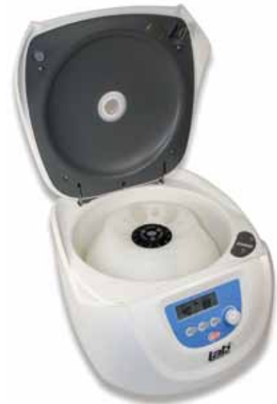
400.003.301 Clinical-E supplied with 400.003.308 Rotor